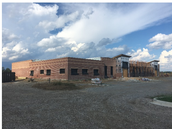
Facility progress as of September 2018

The facility will respond to medical emergencies, provide limited outpatient diagnostic services.